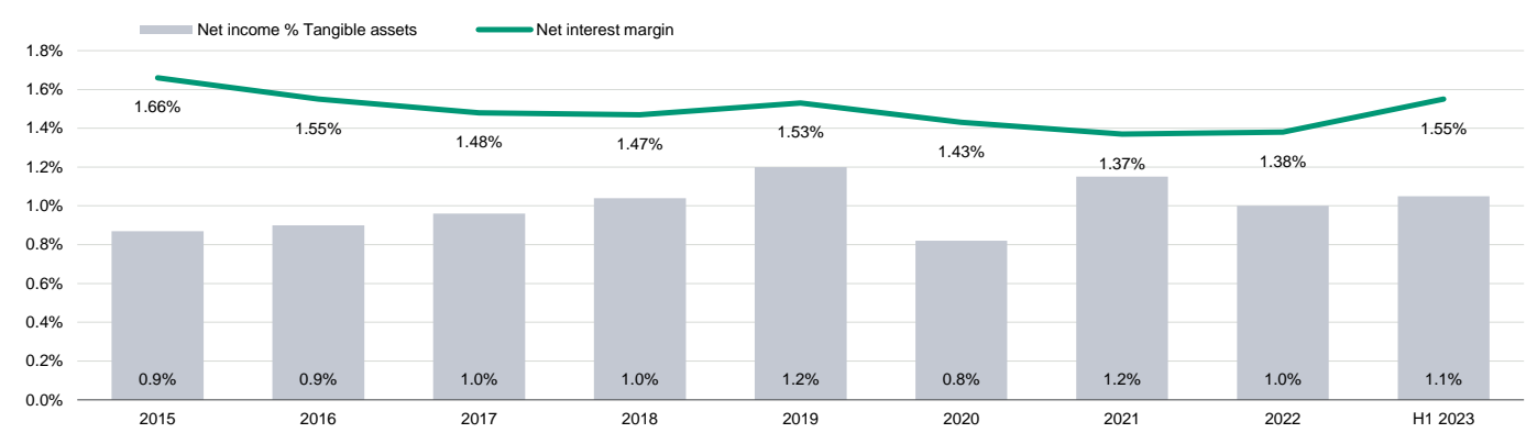
Exhibit 5 Profitability evolution Moody's-adjusted figures

Includes assets transferred to covered bond companies.