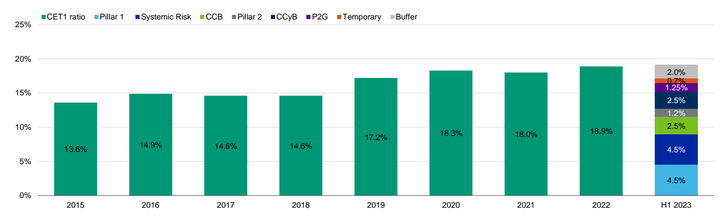
Exhibit 4 SMN benefits from strong capital buffers, with a CET1 ratio 2% above the 17.2% minimum requirement at end June 2023(SpareBank 1 SMN's CET1 ratio evolution)

The temporary requirement of 0.7%, which is a Pillar 2 add-on, is implemented until the FSA approves the revised IRB models.