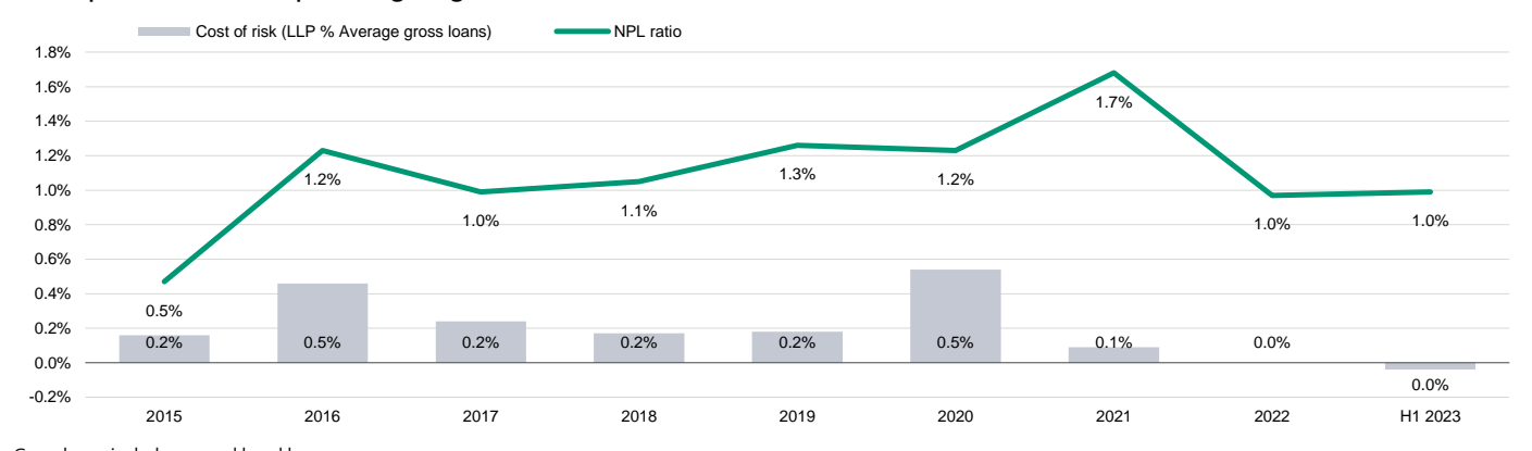
Exhibit 3 SMN's problem loans as a percentage of gross loans and cost of risk evolution

Gross loans include covered bond loans.