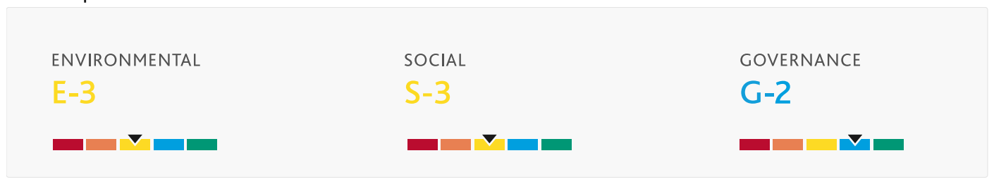
Exhibit 7 ESG issuer profile scores

SpareBank 1 SMN's CIS-2 indicates that ESG considerations do not have a material impact on current ratings. This reflects the limited credit impact of environmental and social risk factors on the ratings to date, and the low governance risks.