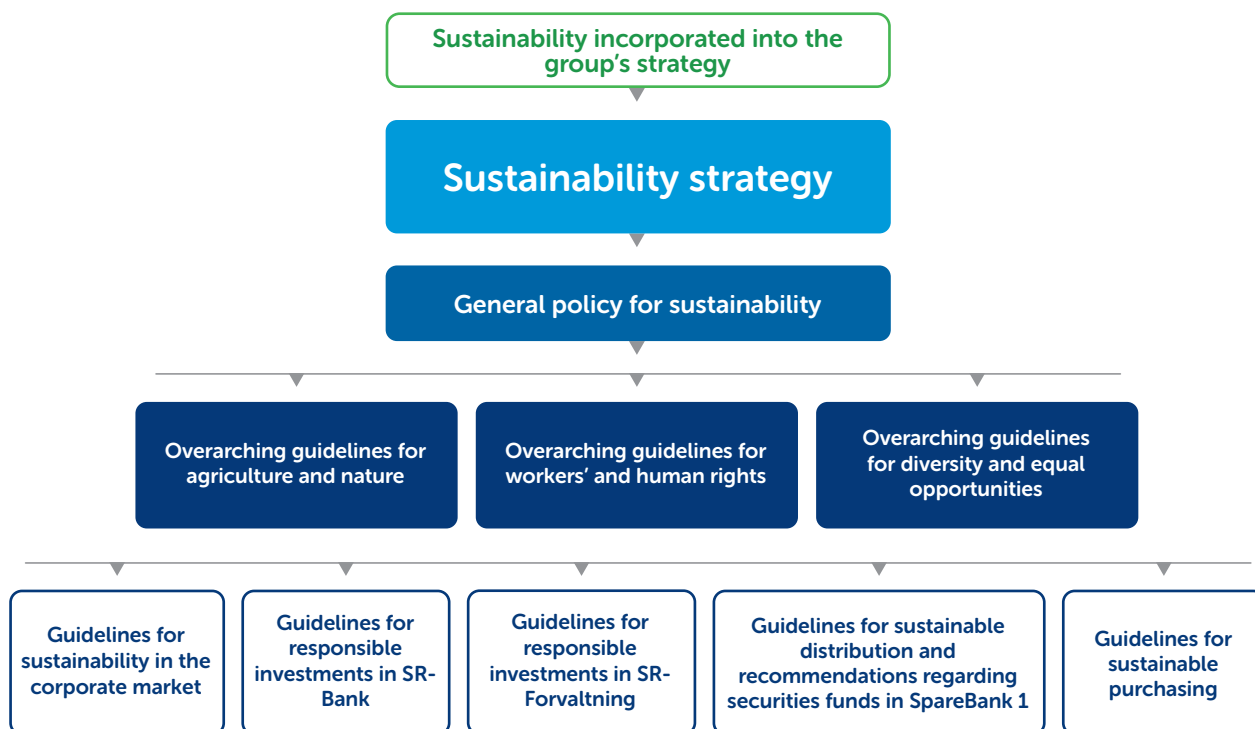
The figure shows how the governing documents have been incorporated into the group.